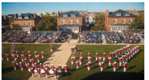
THE MARINE BARRACKS