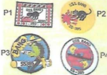
5" Jacket Patch - $5.00 ea. State Your Choice