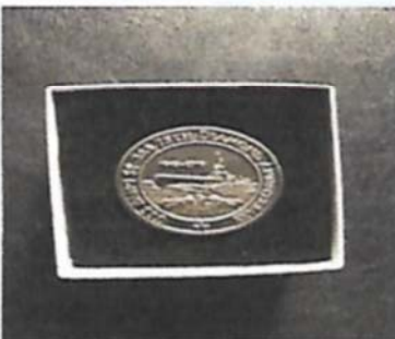
75th Anniversary Hat / Lapel Pin