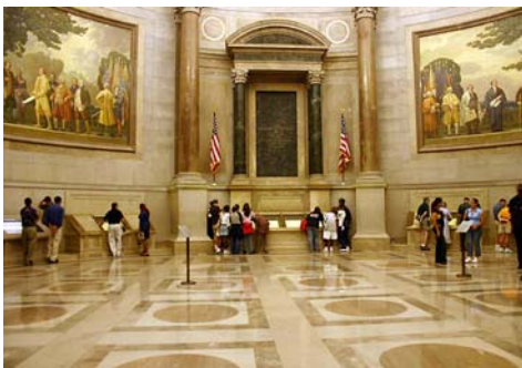
THE NATIONAL ARCHIVES