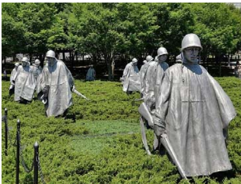
KOREAN WAR MEMORIAL