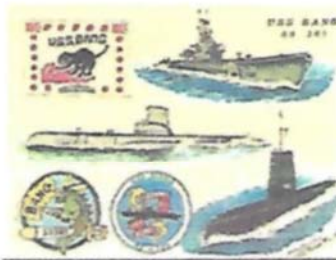
6" Window Trilogy Decal $5.00 ea.

All orders are normally sold at our Reunions or shipped via USPS Priority Mail. Send mail orders to Isaac Cohen with your check payable to USS Bang and be sure to include a few extra bucks to cover the postage.