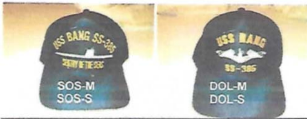
Navy Blue Balicap - $8.00 ea. Solid or Mesh top State Your Choice