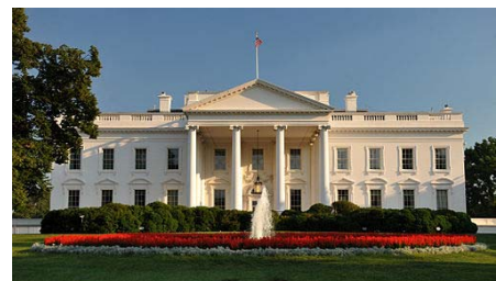
THE WHITE HOUSE