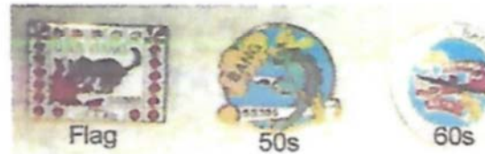
1" Lapel/Hat pins - $5.00 ea. State Your Choice