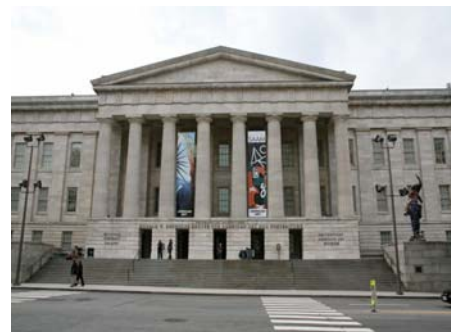
THE NATIONAL GALLERY