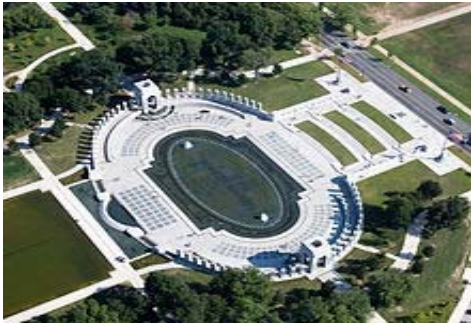
WORLD WAR II MONUMENT